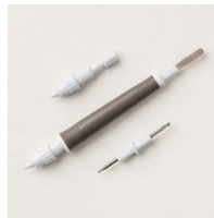
Take Your Pick [144107] $10.00