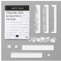
Ornate Thanks Bundle (English) [154115] $46.75

THANK YOU my friend SO GRATEFUL to know THANKS from the bottom of my heart For I would love to see you for everything just wanted to say how much you made my day as hard as work for all your help you're amazing from all of us for all you do