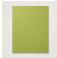
Old Olive 8-1/2" X 11" Cardstock [100702] $8.75