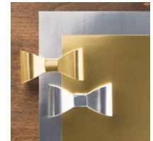
Gold Foil Sheets [132622] $5.00