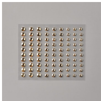
Gilded Gems [152478] $7.00