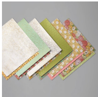
Ornate Garden Specialty Designer Series Paper [152488] $15.00