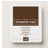
Early Espresso Classic Stampin' Pad [147114] $7.50