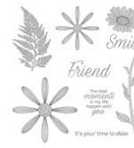
Daisy Lane Cling Stamp Set [149325] $23.00